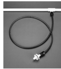
Figure 4. Sampling Point with Capillary Tube

The ORION XT product line offers an array of air sampling network accessories such as a sampling point, capillary tube rolls, sampling point, port and pipe labels.