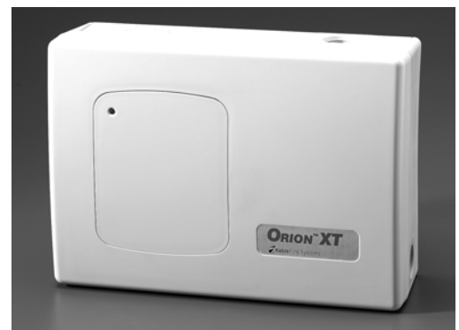
Figure 2. ORION XT Detector