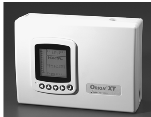
Figure 1. ORION XT Detector with Optional Display Module

When a combustible material reaches its ignition temperature, the combustion becomes self-sustaining and is called a fire. At temperatures much below the ignition temperature, chemical reactions generate airborne particles. This is typically called the incipient stage of a fire and is followed by visible smoke, flame and finally an intense heat stage. Detection during the incipient stage allows time for corrective action, possibly preventing an escalation of the fire condition, and thus minimizing fire damage.